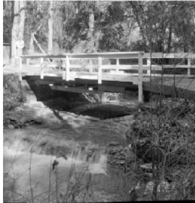
Figure 3a. Original Image

The final image was compressed the least. The transformed matrix here has 9,060 non-zero entries whereas the original matrix again had 65,536. This gives us a compression ratio of approximately 7 to 1. Here we have an even better approximation to the original image